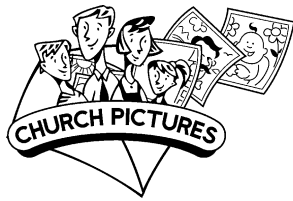
PHOTO DIRECTORY CONTINUES