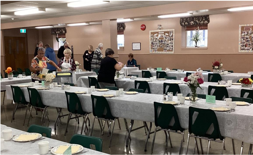
Volunteers getting the tables ready for lunch.