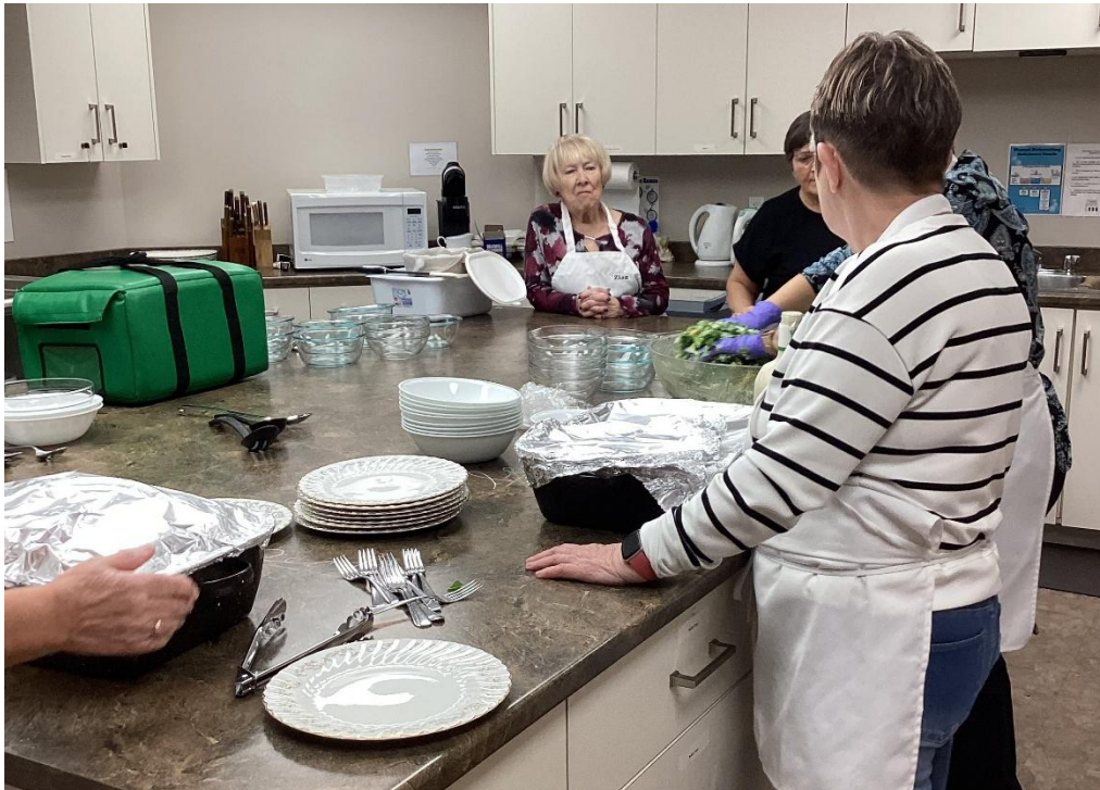
Food has arrived, kitchen prep work will begin.