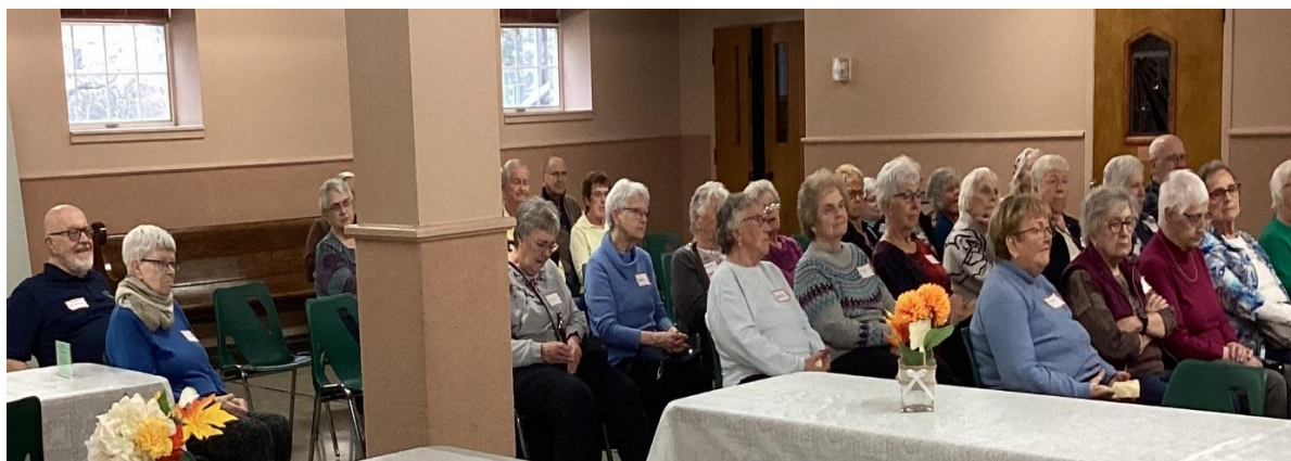
An interested audience!